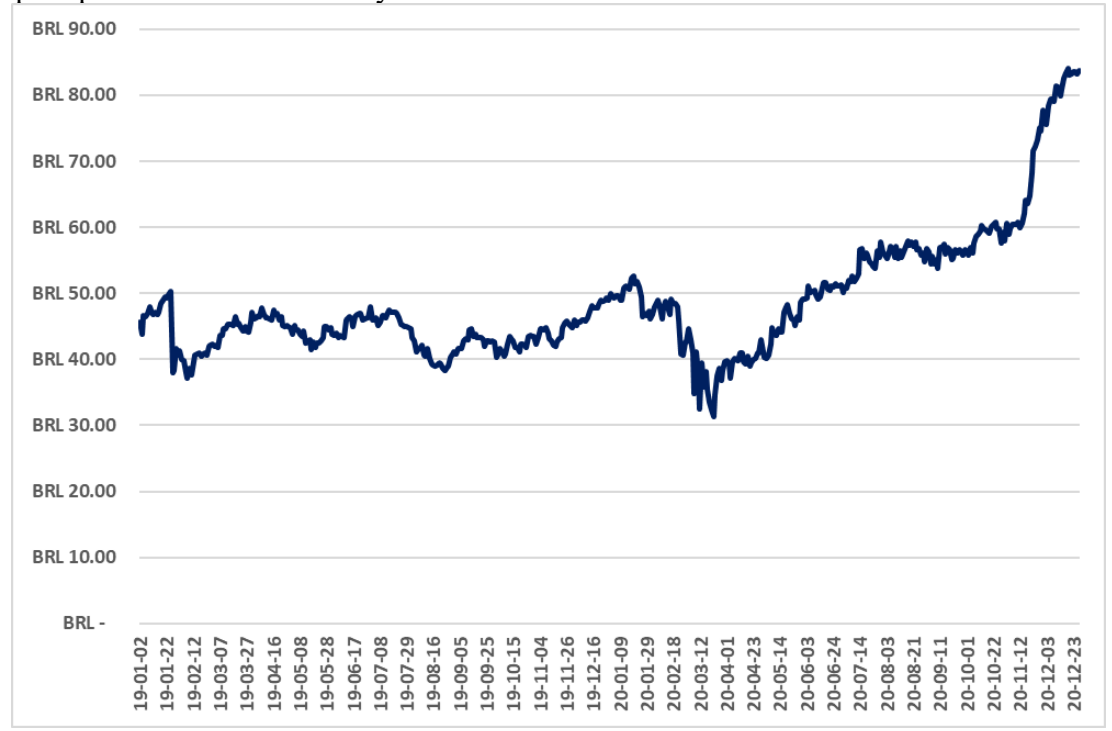
Figure 2 Closing price of Vale's common equity, adjusted for dividend payments.

For the purpose of the analysis intended for this study, the results indicated that the historical simulation model was the most appropriate for the VaR calculation when compared to the parametric method. As an example, from the graph of closing prices of the hypothetical mono equity portfolio (a), composed of common shares of Vale, it was possible to conclude that the sampled price series is not steady.