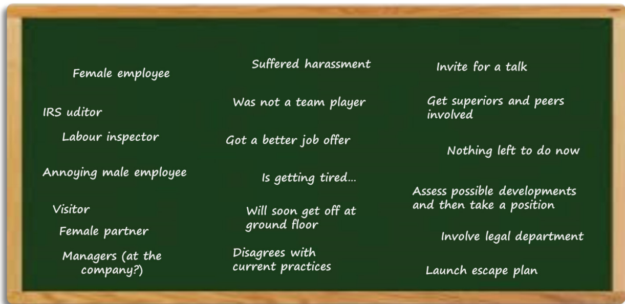
Figure 2. Blackboard use: initial probing of structural elements.

After five to ten minutes of game, or if participants’ creativity declines before that, the instructor can interrupt the activity.